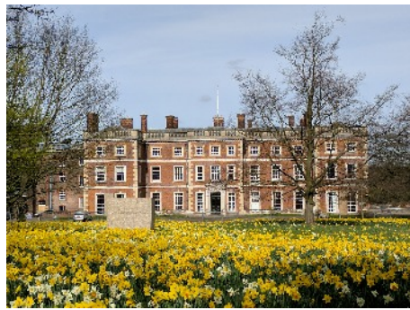
Trent Park house and the daffodil lawn

It is 1942, England. You are a German General, captured in North Africa, flown to Britain and now being driven to an unknown location in a blacked out limousine. After a long and bumpy ride, the doors open. Instead of a grim prisoner camp, your eyes reveal a grand red brick mansion, surrounded by landscaped gardens and renaissance statues. The setting is bucolic, were it not for the barbed wire perimeter, lookout tower, armoured cars and British soldiers patrolling.