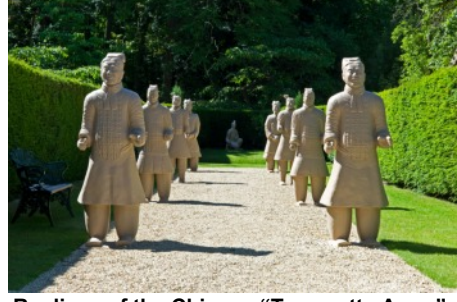
Replicas of the Chinese "Terracotta Army", Buscot Park

trip, Jubilee Hall, 2 Parsonage Lane, Enfield, EN2 0AJ. Ensure you confirm the names of those coming, whether you want lunch and any dietary restrictions, and the society each person belongs to if they are paying one of the reduced rates.