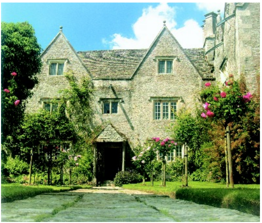
Kelmscott Manor from the east lawn

Arriving at Kelmscott about 11 am we will have an introductory talk and then make a private visit going through the house and gardens in free flow at our own pace. A buffet has been arranged at Kelmscott at a cost of £7.50 to include 2 courses and a soft drink. This will be the only place to get refreshments until we reach Buscot after 2.30pm, so if you decide not to take up the buffet offer you will need to make your own arrangements.