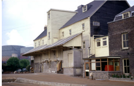
2. By 1968, when Geoffrey Gillam photographed the buildings, the mill stream no longer flowed past the old mill. Since then a modern loading bay extension has been constructed.