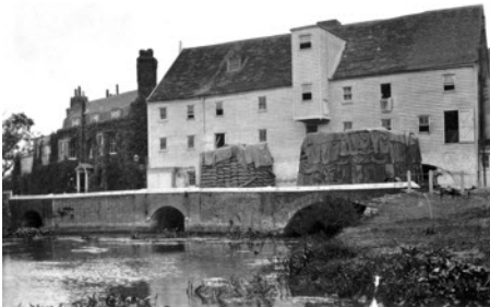
1. A 1910 view of the 18th century, part-weatherboarded old mill. It was powered by water from a mill stream diverted from the River Lea until 1909, when electric power was introduced. In the centre is a projecting sack hoist.