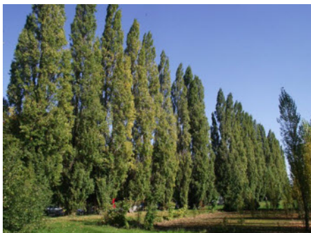
Poplars, Hoe Lane