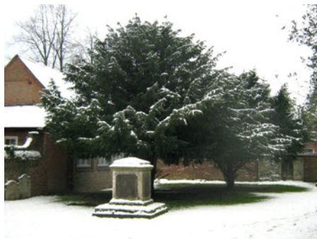
Yews, St. Andrew's Churchyard