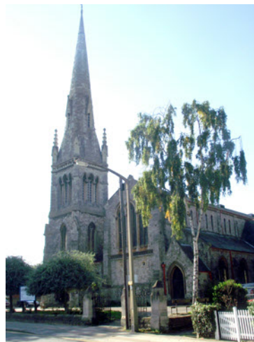
Christ Church, Chase Side