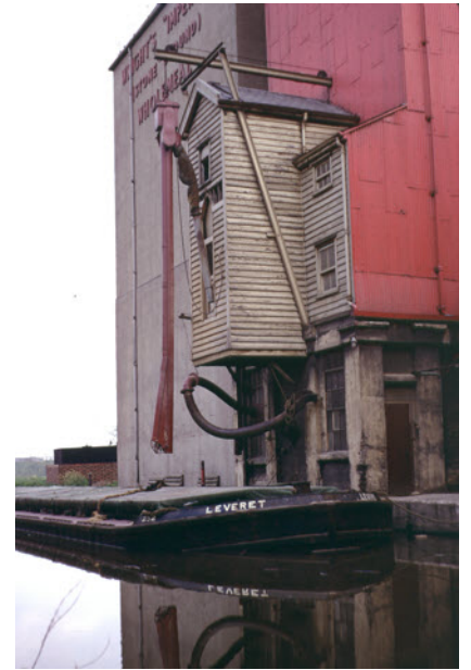
6 The new mill to which wheat was brought by barge along the River Lea.