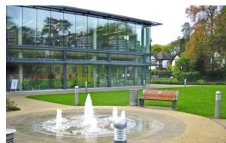
The new fountain on the Library Green