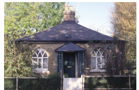
9. A 2009 view of the early 19th century Lodge Cottage at the entrance to the mills.