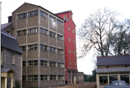
7. A pre-cast concrete silo was added in 1957 and the new mill was extended in 1960.