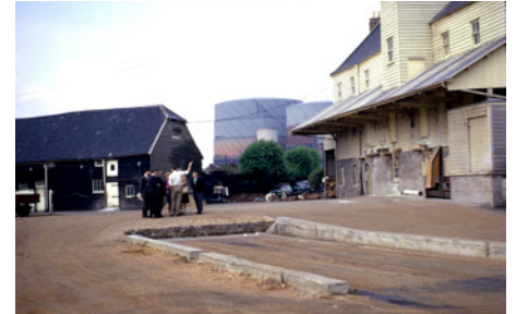
3. The bagged flour was transported by horse-drawn carts until 1906, when steam wagons were purchased. The stables can be seen on the left.