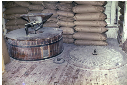
5. Mill wheels used to grind the wheat.