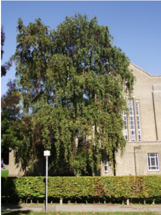
Birch and hedge, St. Peter's, Viga Road

What do these trees all have in common? (* Answer below)