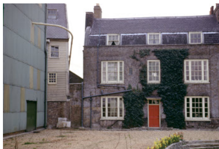
8. The 18th century mill owner's house has dormer windows in the mansard roof.