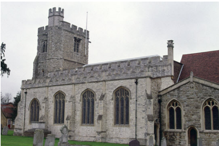
4. The south aisle was added in 1889 when box pews and galleries were removed from the 15th century nave.