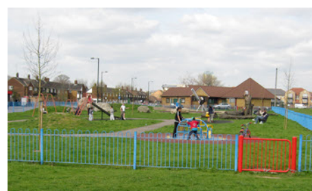
The children's play area at Montagu Recreation Ground, showing some of the heavy standard field maple trees funded by the Enfield Society to provide some shade.