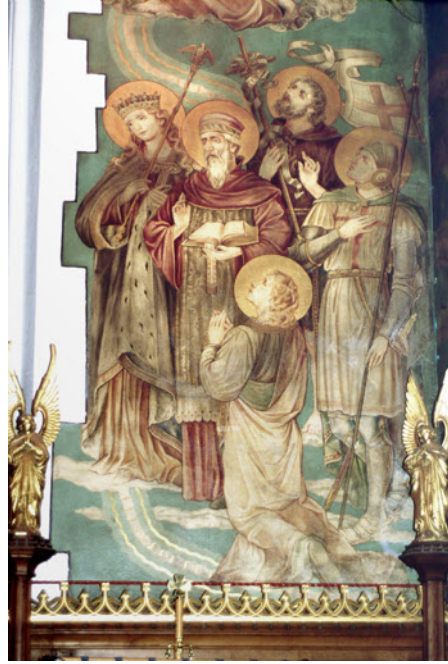
6. Late 19th century paintings of Christian saints on the east wall of the chancel.