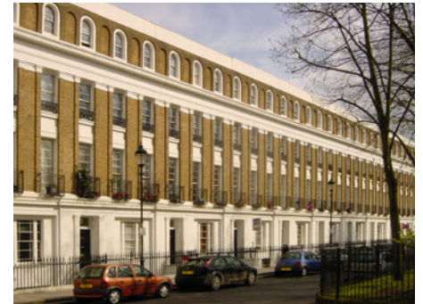
Milner Square, Islington