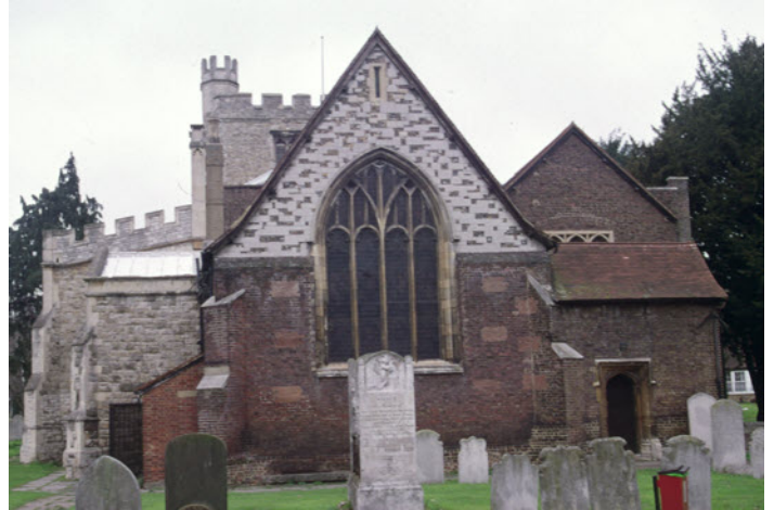
2. The chequerwork masonry around the east window is 15th century. The lower part of the chancel and north aisle were refaced in stock brick in 1772.