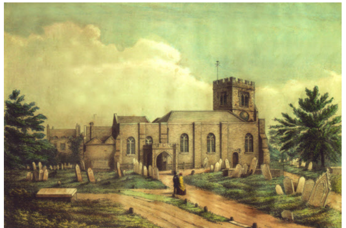
3. A mid-19th century view from Church Street