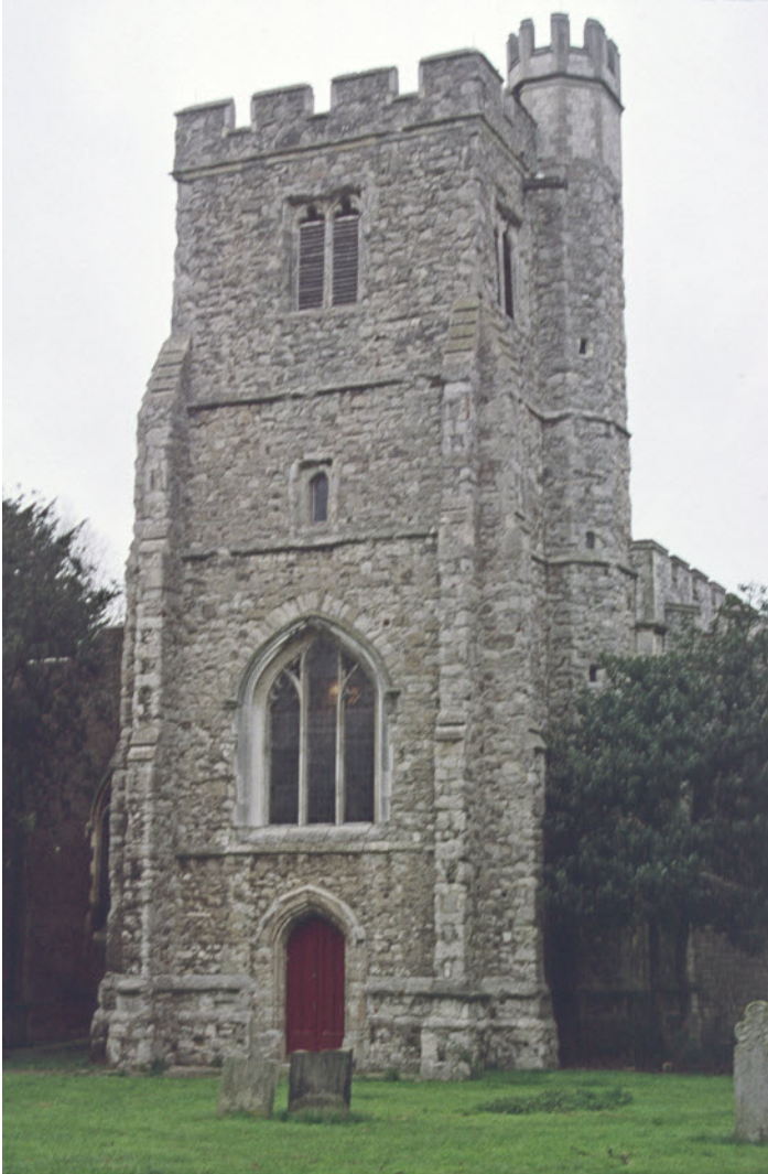
1. Fragments of the original 12th century church have been discovered, but the oldest visible external feature is the fine 15th century ragstone rubble tower, which has the only surviving medieval windows in the church.