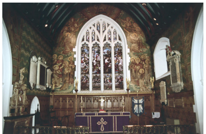
5. The 15th century chancel with 19th century window and wall decoration. Under the chancel is a sealed-off crypt.