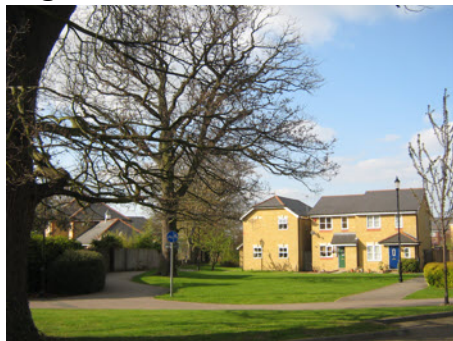
Trees and landscaping at Highlands Village

Our Winter 2009 News highlighted the threat to take the bulk of the "Highlands Village" out of the conservation area. We heard nothing further in response to our objection until a short paragraph tabled at the February Conservation Advisory Group informed the meeting that Phase III of the Conservation Area Review had been approved. In other words our views had been discounted – a big disappointment. Probably our mistake had been not to object at the time of the publication of the original Appraisal for the conservation area, which took a surprisingly dim view of its quality. For example, the landscaping, with its numerous fine trees incorporated into the streetscape, was awarded a mere 2 points out of 5.