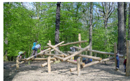
“Risk experience” in Grovelands Park

What do other readers think? Is this an inappropriate location, or a way of encouraging young people to visit and climb among natural woodland? Let’s have your views for our next issue. - Ed.