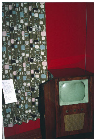
Curtain, 1952, Ekco television 1953