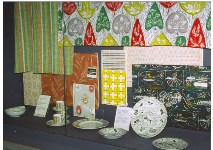
Wallpapers, plates, etc. 1950s