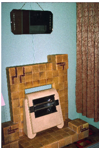
Fire, 1930s, Swindon fireplace, 1935, mirror 1940