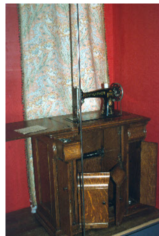
Sewing machine, 1918