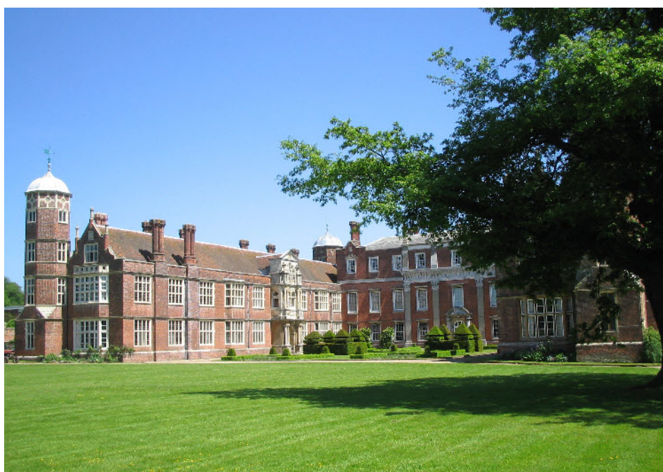
Cobham Hall

The management committee recently confirmed that these trips are for paid-up members of the Society. If anyone who is not a member wishes to come, they can easily join for a minimum subscription of just £2.50 per year. Application forms are available from Jubilee Hall or may be downloaded from our web site at http://www.enfieldsociety.org.uk/joining.htm .