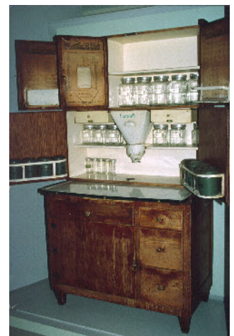
Easiwork kitchen cabinet, 1929