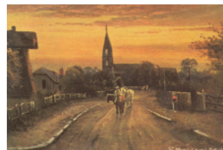
St. Mary's and the windmill