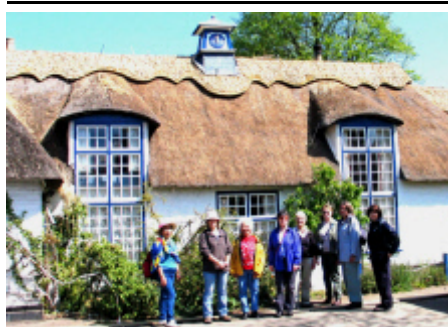
Houghton to St Ives, 28th April