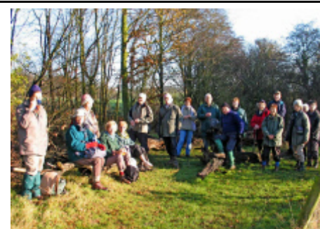
Jubilee Footpath, Enfield, 16th December