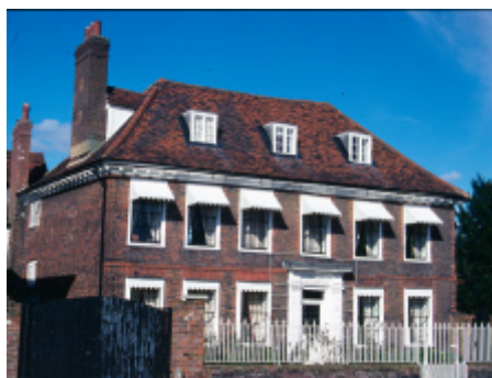
The Hermitage, Forty Hill, 1704