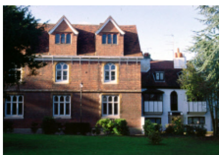
Enfield Grammar School, 1590s, and Uvedale House, early 16th century