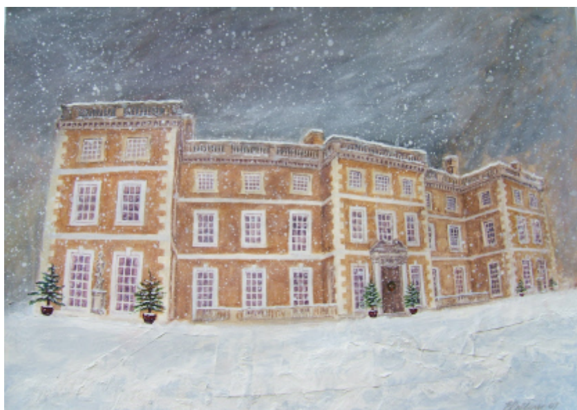
Trent Park House