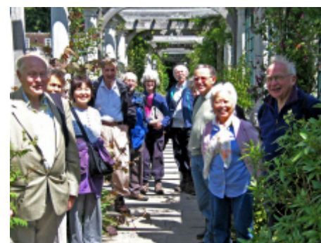
Hill Garden Pergola, Hampstead Heath, 14th July

Photographs from recent walks, by John R. Bourne