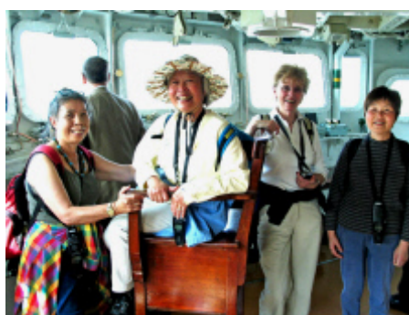
HMS Belfast, 14th April