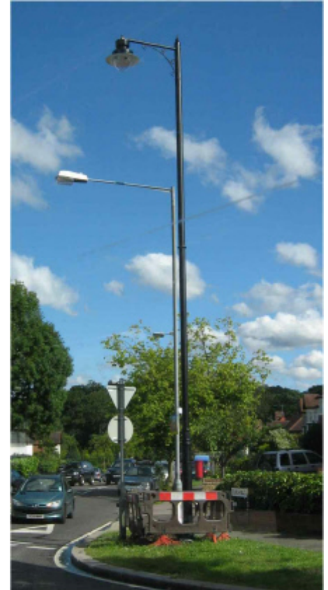
New lamp post in Winchmore Hill