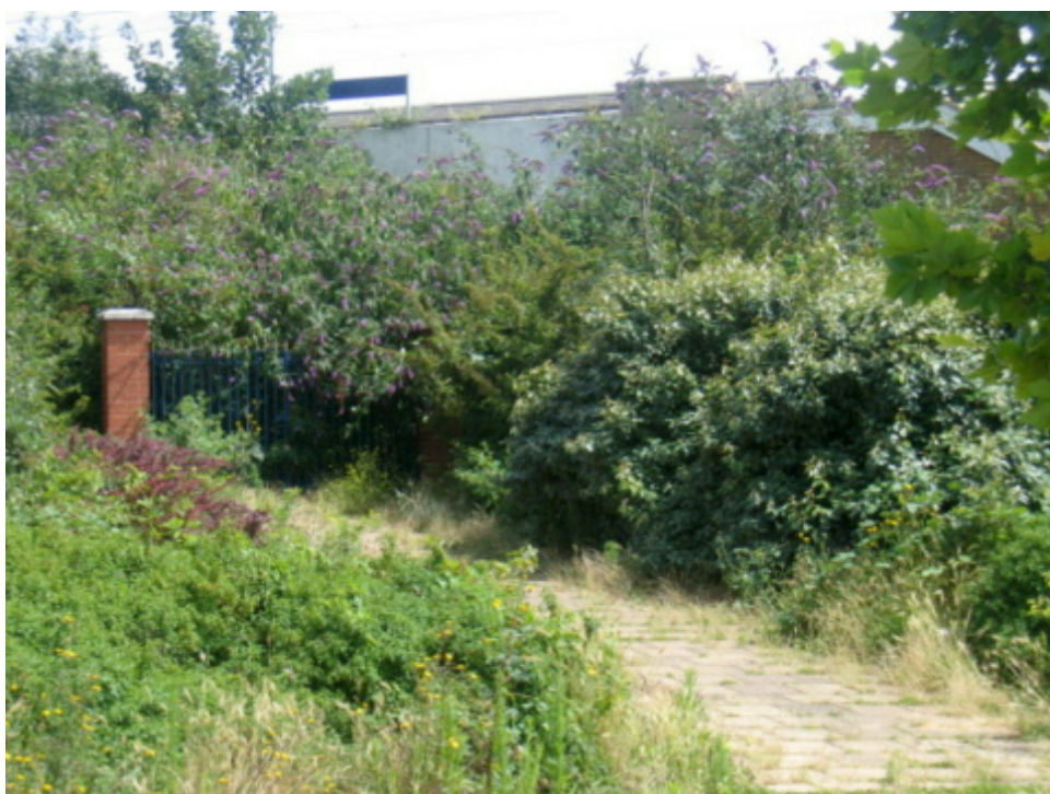
Overgrown gardens near Silver Street station