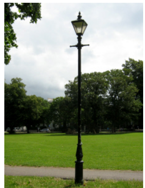
Lamp post on Clapham Common