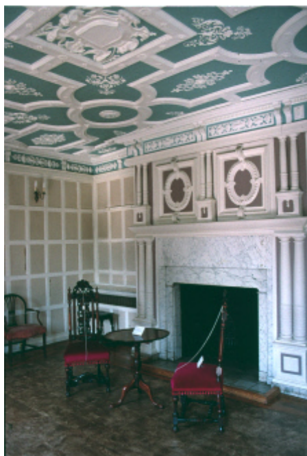
Interior, Forty Hall, 1629-1636