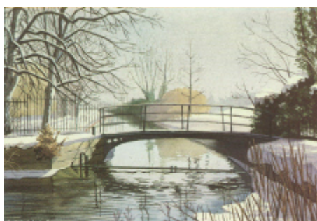
Town Park and New River