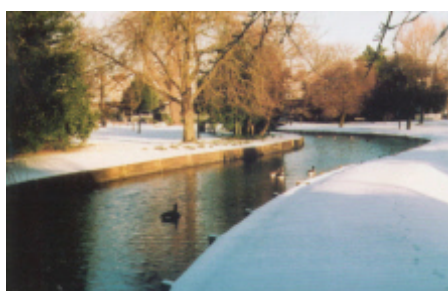
New River Loop