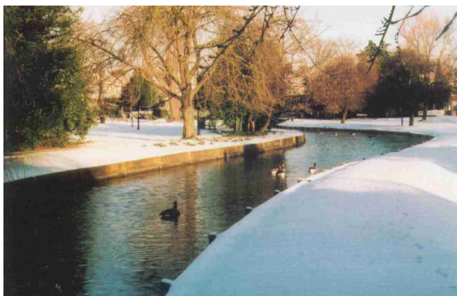
New River Loop