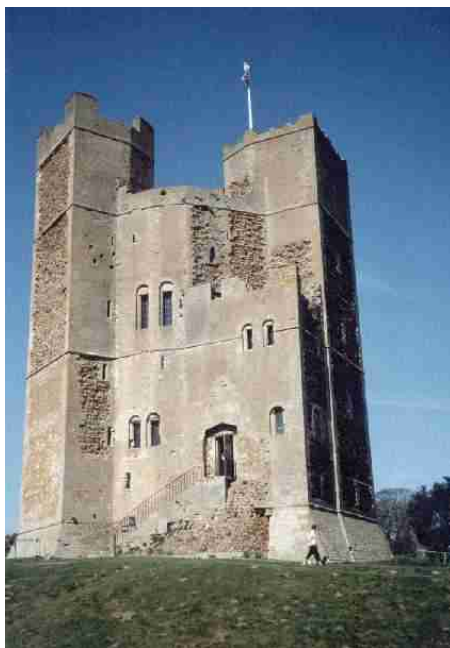
Picture of Orford castle

This trip gives us the opportunity of a visit to a royal castle built by Henry II for coastal defence in the 12th century, an English Heritage site. It has a magnificent keep which is mostly intact, together with three immense towers reaching to nearly 90 ft, offering, to those willing enough to ascend the heights, fine views over the Suffolk countryside.