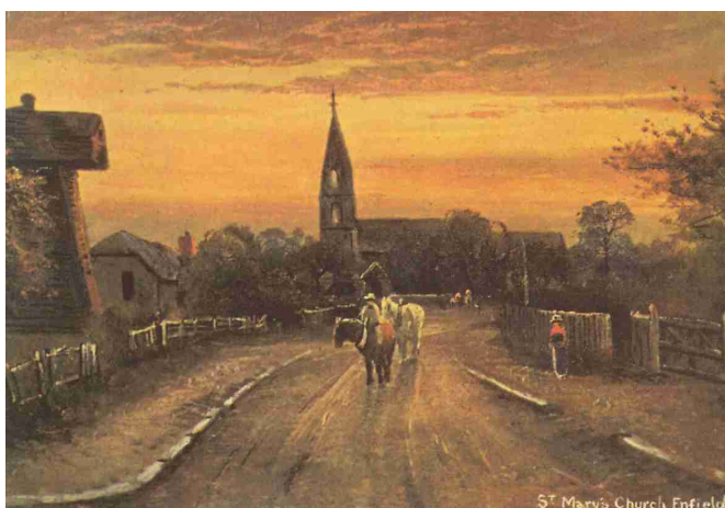
St. Mary's and the windmill