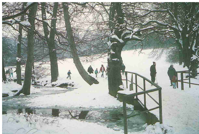
Hilly Fields in the snow