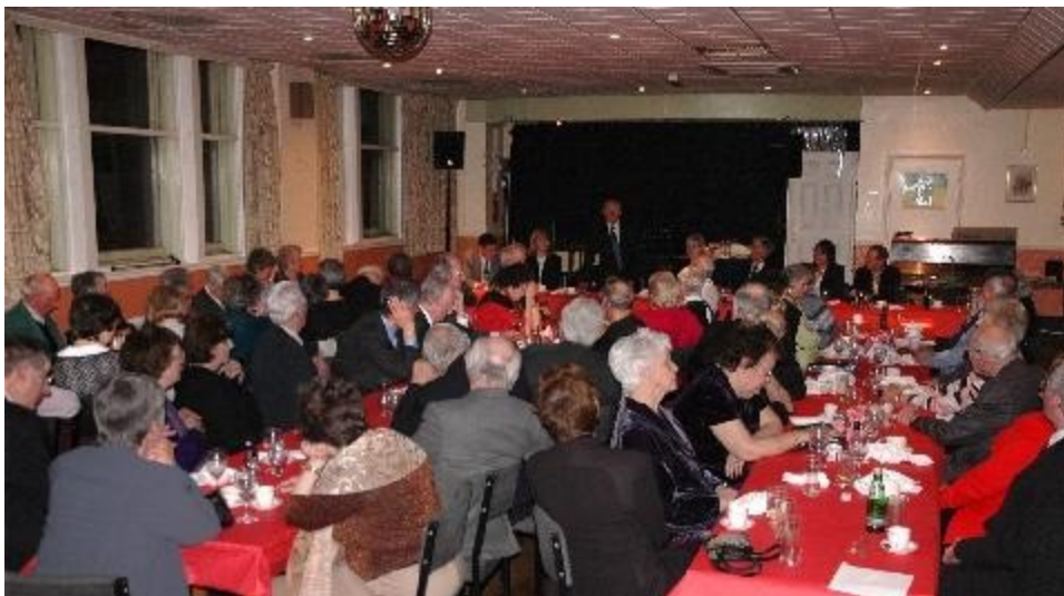
EPS 70th Anniversary Dinner - 10th March 2006 (see p.5)

The Society's publication Heritage Walks no.2: Enfield Town is available for those who cannot come along on the 21 st or who want a reminder of some of the places they will see. £1 from the sales table at Jubilee Hall meetings or £2 by post.